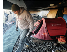
Wayne pastor's mission leads him to ...