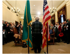
Washington State has enough votes to ...