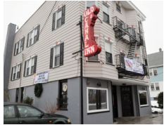
Famed Nutley inn burglarized