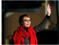
Giffords says farewell to Tucson ...