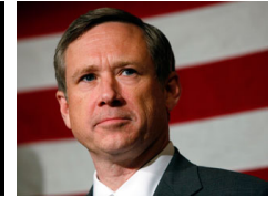
Illinois Sen. Kirk suffers stroke ...