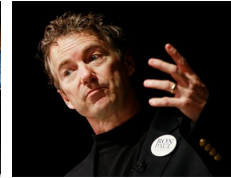
Sen. Rand Paul stopped by Tenn. ...